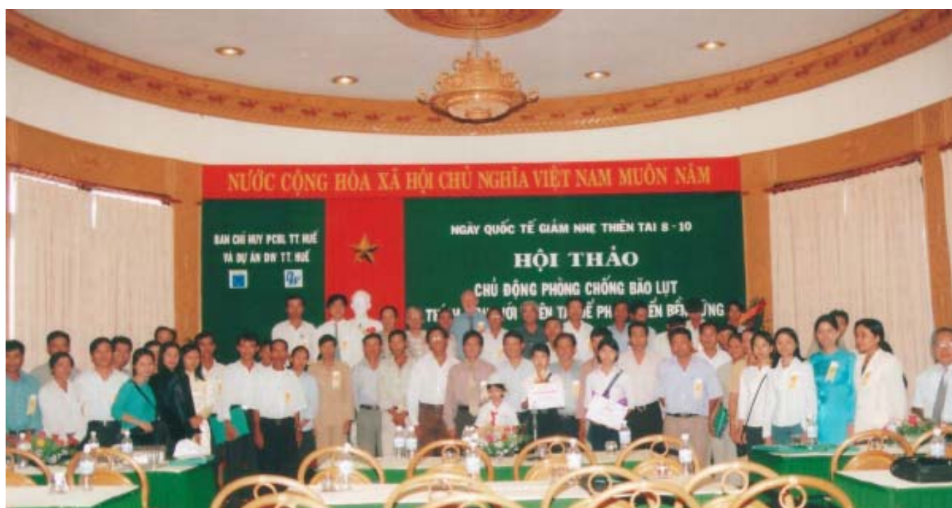
Provincial meeting in Hue 8 th October 2003

Cover page / Banners DWF/ Drawing: despite flooding, the children continue to go to school in Thuy Thanh