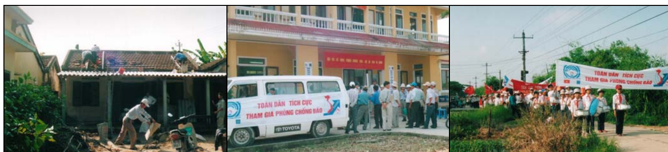
Activities in Thuy Thanh Commune 8 th October 2003